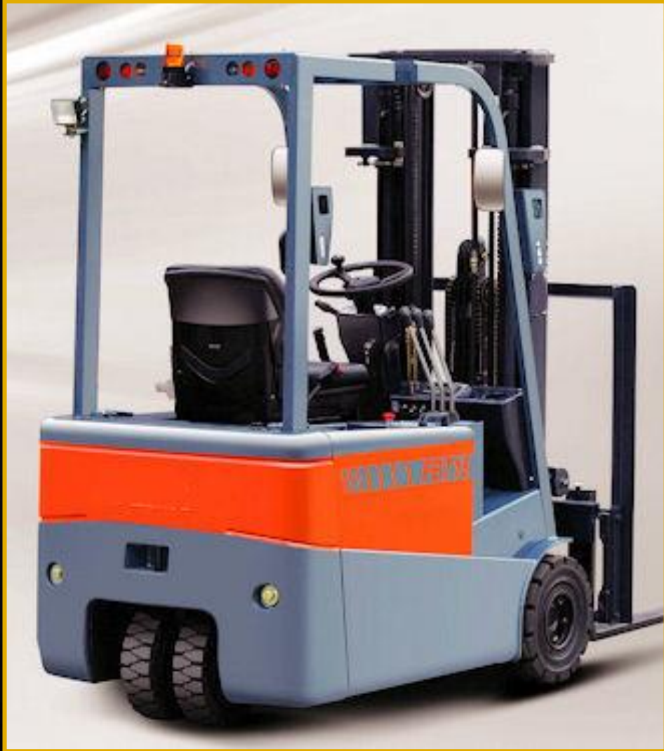
WFET30 – WFET35P